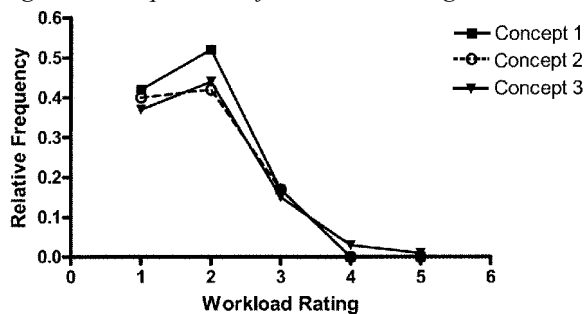
Figure 1: Frequencies of Workload Ratings

To examine assumptions of the modified ATWIT technique, Pearson's correlations between the pilots' ready latency, query latency and workload rating were computed, as shown in Table 3. Workload ratings were significantly correlated with ready latency, (r(366)=.25, p<.001) and not with query latency, (r(366)=.05, p=.35). The finding that ready latencies and subjective responses are correlated, but query latencies and subjective responses were not, suggests that the Ready Response Latency is a valid measure of workload. Workload ratings