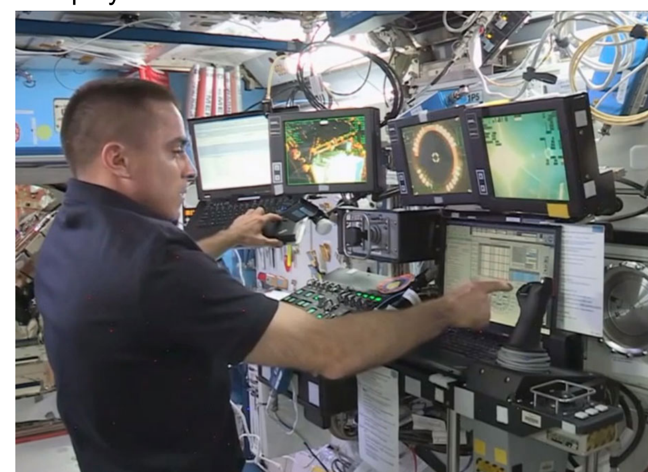
H-II Transfer Vehicle (HTV)-4 Capture and Berthing: Robotics Ground Controllers powered up the Space Station Remote Manipulator System (SSRMS), August 2013